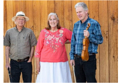
Green Bush Spring