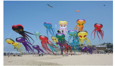
Lincoln City Kites

Lincoln City is a string of small towns that banded together to become one. Get out your kites or go buy one, take your cameras, and go to the long, sandy beach which will have a sky full of kites of all types , some quite large. While in the area, and you like waterfalls, there is Drift Creek Falls with a 7-mile round trip hike Southeast of Lincoln City off Mile post 119 on US 101. Devil's Lake to the North, affords a chance to go kayaking or paddle boarding in a safe space to ply your oars. Siletz Bay National Wildlife Refuge up the coast is a quiet place to wander