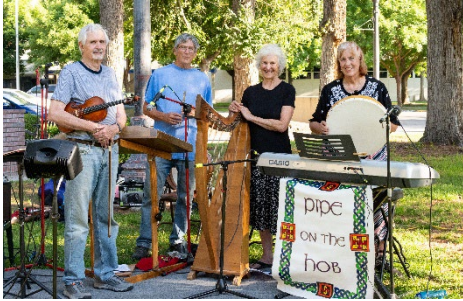
Pipe On The Hob Vicki Cheney Photo

Pipe on the Hob will play all the music for the church service at Bethel Lutheran Church on Sunday, March 15 th , 10:30 am.