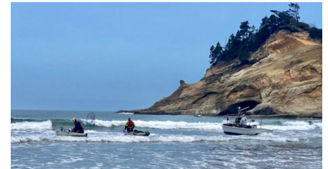
Cape Kiwanda Dories

However, I would peel off at Pacific City and take the Sandlake Road (part of the Three Capes Scenic Loop). Cape Kiwanda is the southernmost cape and is, basically, a big pile of sandstone with a great beach. Dories (flat-bottomed boats) are launched directly off the beach here. Continuing North, turn left on the Cape Lookout Road, wind up the headland and stop at the pull-outs. One trip, as Patty Morrison and I were getting out of the car at one of the pull-outs, a hang glider came swooping overhead and down to the beach. There is a trail out to the end of Cape Lookout that is worth taking, both for the views and the whales.