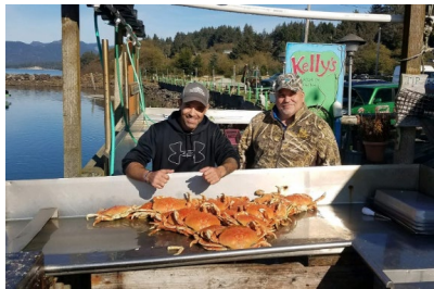
Kelly's Brighton Marina

Rockaway Beach is the town that Capitola, CA, used to be, still family friendly. It is one of the coastal cities that used to have trainloads of people from Portland coming for the sea air. Just North of Rockaway Beach is Kelly's Brighton Marina and Campground where you can go crabbing for Dungeness Crabs . Further along you go up Neahkahnne Mountain with vistas that go on forever. A little way further along US 101 is Cale Falcon with a good hiking trail. Back on US 101 after stretching your legs, you will arrive at the much-photographed Cannon Beach with its Haystack Rock. Haystack Rock, like Morro Rock on the California Coast,