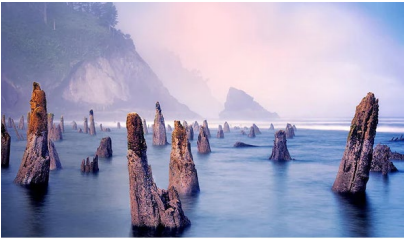
Neskowin Ghost Forest

US 101 goes inland around Cascade Head and back out to the sea at Neskowin Beach State Recreation Site. The Neskowin Ghost Forest has remnants of a Sitka spruce forest dating back 2000 years. At low tide, you can see 100 stumps along the shoreline. Wear your waterproof shoes if you want to see them as you have to cross a small stream. There is also a hike to Cascade head that is considered easy to moderate. Now we are arriving at my very favorite part of this section, The Three Capes and Tillamook. US 101 wanders off inland again here and takes you through farmland and forested hills to Tillamook.