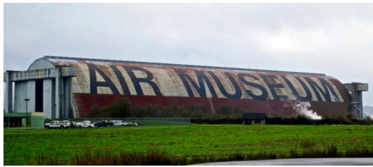
Tillamook Air Museum

Stuff to do around Tillamook. Lots. There is a really good County Museum that is worth the visit; the Tillamook Air Museum is also near town located South of town off US 101 along Long Prairie Road. It has a really huge hangar (I seem to remember that it housed dirigibles between World War I and World War II) with a variety of aircraft and some vintage firefighting vehicles. Munson Falls can be found in the Munson Falls State Natural Site, about 9 miles South on US 101 and Munson Creek Road. It is a multi-tiered cascade and has lots of wildflowers in the