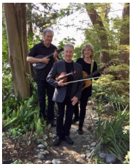
Dos Valley Trio